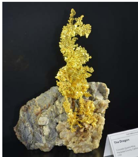
The Dragon gold specimen, Colorado Quartz Mine, Mariposa County, California. This specimen is usually on display in the Houston Museum of Natural Science. In 2022, it was exhibited at the Hardrock Summit.