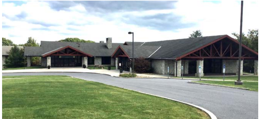
Conference Center at the Living-Learning Center, University of Pittsburgh - Johnstown. Parking is in the lots to the left (north).

The Symposium will have informative talks by knowledgeable speakers on minerals, geology and mining in Pennsylvania and beyond (see page 2). This is a hybrid meeting with attendance both in person and via Zoom. Doors open for check-in at 8:00 a.m., with the presentations scheduled to conclude at 5:00 p.m. As usual, the Symposium will include a silent auction, give-away table, and plenty of opportunities for visiting with fellow enthusiasts. All interested mineral collectors are invited to register and attend.