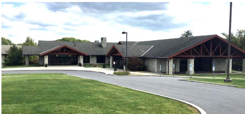
Conference Center at the Living-Learning Center, University of Pittsburgh - Johnstown.

Welcome! This is the main entrance lobby where all attendees will enter, registration and information tables will be here, large area for exhibit tables.