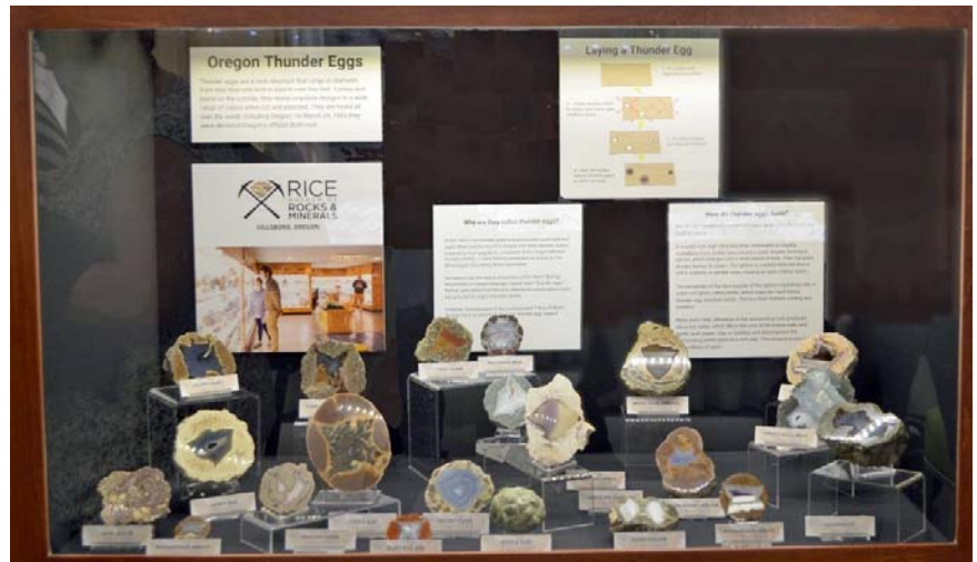
The Kay Robertson Educational Award at the Tucson Gem and Mineral Show was presented for the best institutional educational exhibit to the Rice Museum of Rocks & Minerals, Hillsboro, Oregon for its display "Oregon Thunder Eggs."