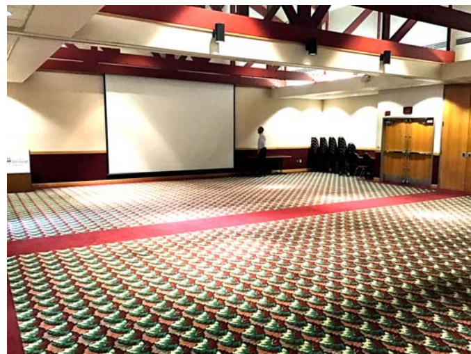
Symposium - picture this room filled with fellow collectors, and fascinating presentations on Pennsylvania minerals on the screen!