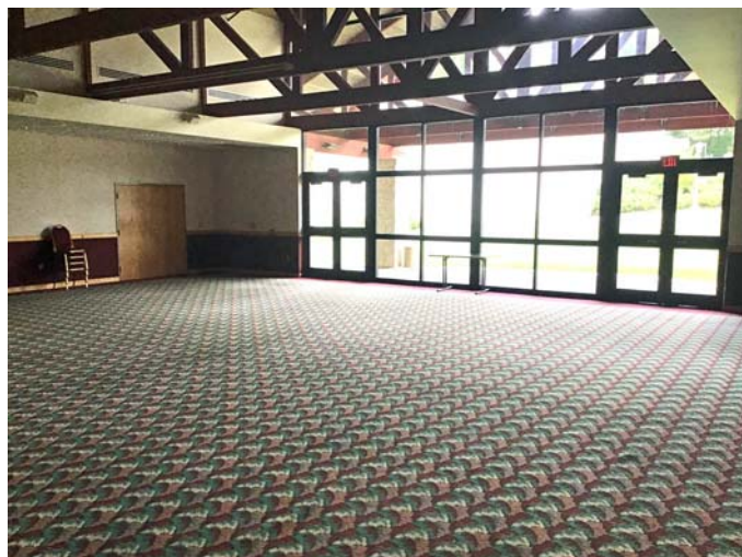
Mineral Show - picture this room filled with 40 tables of mineral, gem & fossil vendors!