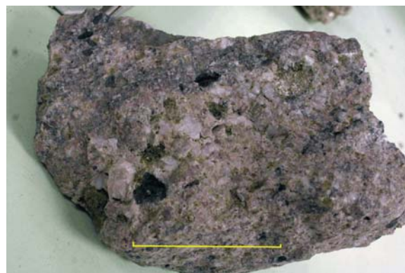
Green andradite garnets in meta-conglomerate. Scale bar is 5 cm.