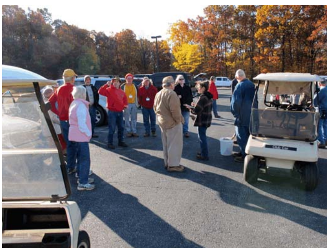
The group met in the parking lot and picked up golf carts.

Participants are invited to submit the specific sites at which they found specific minerals, as a reference for future collecting. Contact the Secretary (see p. 4) for a Google Earth KMZ file of annotated locations.