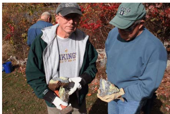
Serpentinite near approach to hole #11.