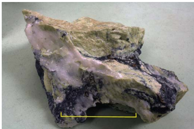
Serpentinite, magnetite, chalcopyrite, and magnesite. Scale bar is 5 cm.