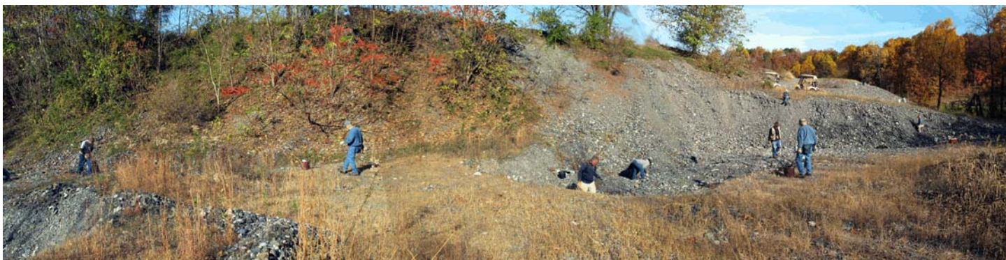
One of the collecting areas of exposed mine dumps at Iron Valley Golf Club.