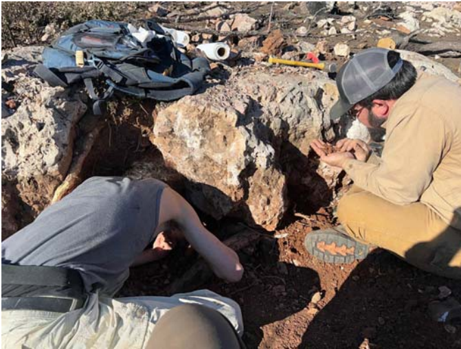
Diamond Point Mine